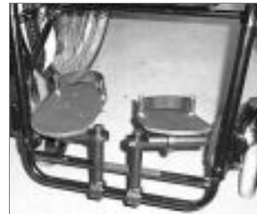
15015 (2 each) shown with footplates (not included)