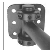
15050 close up of mounting plate