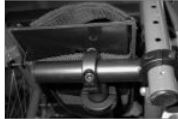
15030 shown with shoe holder (not included)